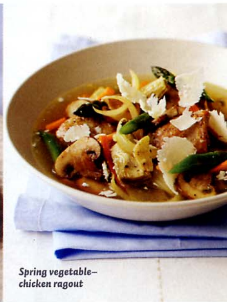
Spring vegetable- chicken ragout

parsley sprigs. Bring mixture to a boil, then reduce heat to medium-low. Cover and simmer 40 minutes. Take pot off heat and remove parsley sprigs and chiles. Remove skin from chicken.