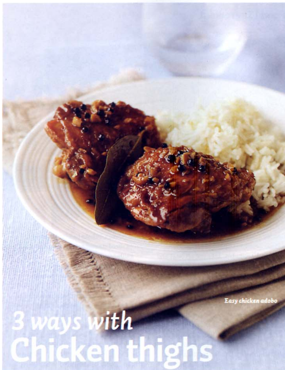
Easy chicken adobo