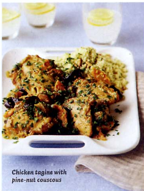
Chicken tagine with pine-nut couscous